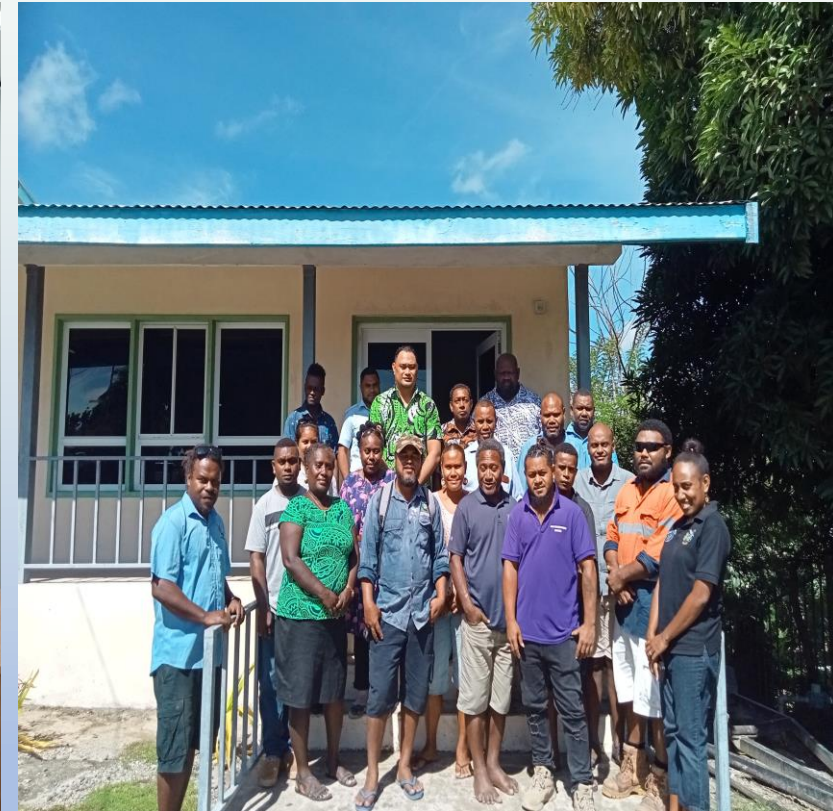
Solomon Is, April 2024