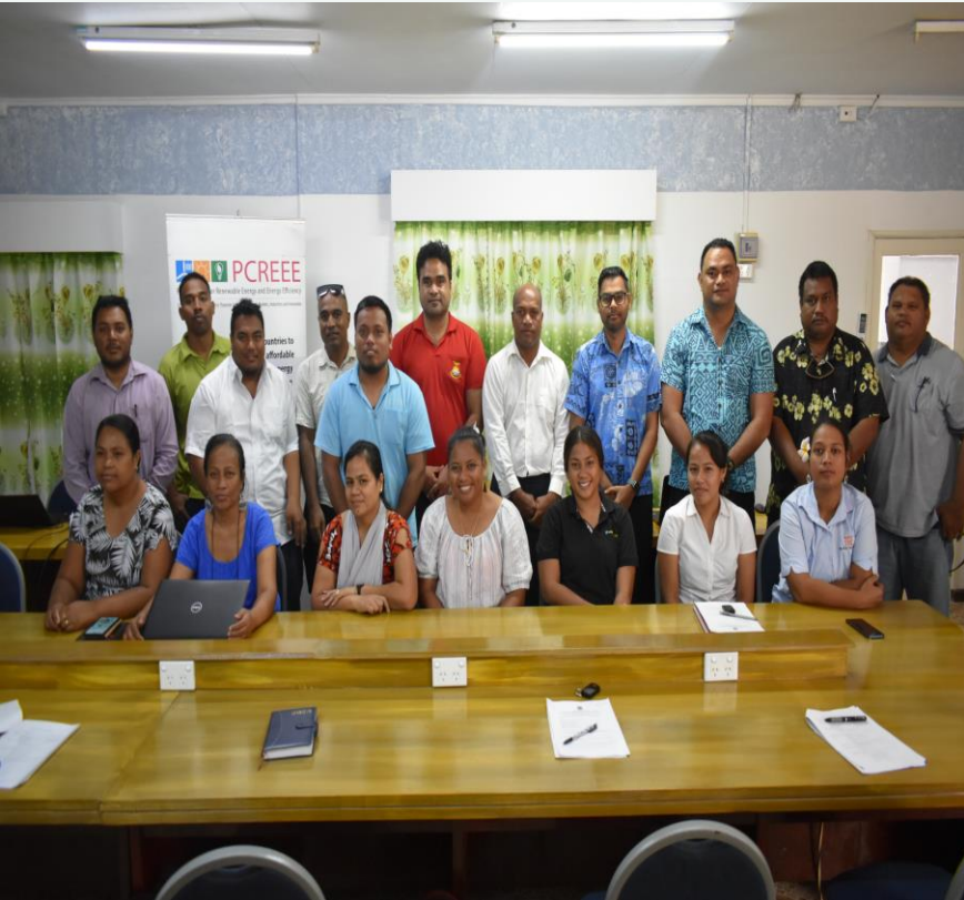
Kiribati, March 2023