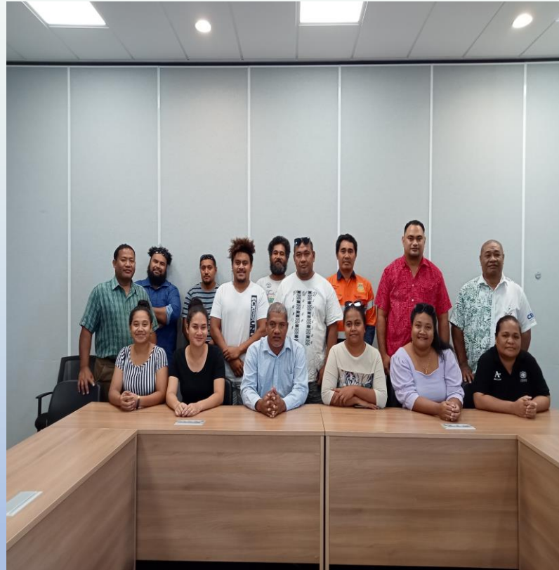
Tuvalu, May 2023